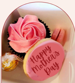
COOKIES & CAKE PACK $10