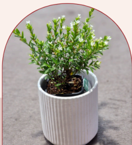
SMALL POT PLANT $12

All gifts will be delivered to students on Thursday, 9 May 2024