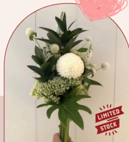
POSY OF FRESH FLOWERS $15

ALL ORDERS ARE TO BE PLACED BY FRIDAY 3RD MAY VIA THE QKR! APP